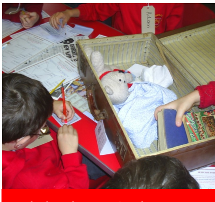
Exploring the WW 2 suitcases

These boxes are great prompts for storytelling and thinking about how we used to live.