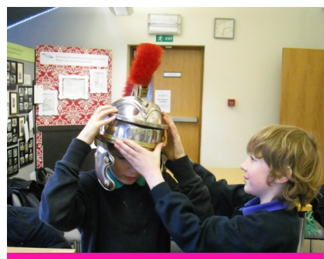
Trying the Roman helmet for size

Schools often use these loan boxes to compare life in a Roman garrison, story telling or descriptive writing.