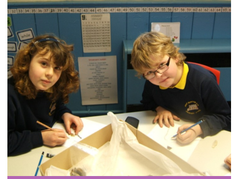
Archaeological illustrators in the making

These objects are ideal for Archaeological illustration activities, story telling or discovering how early settlers in the Yorkshire Dales lived.